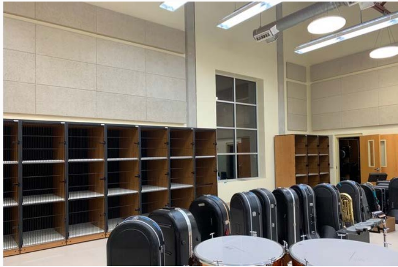
Band: Acoustical wall treatment, flooring & light improvements