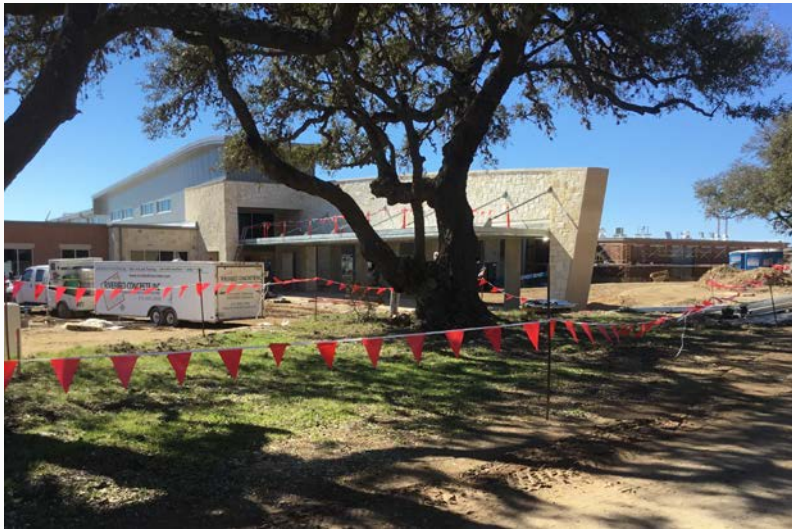
Front Entrance / Parent Drop Off Canopy