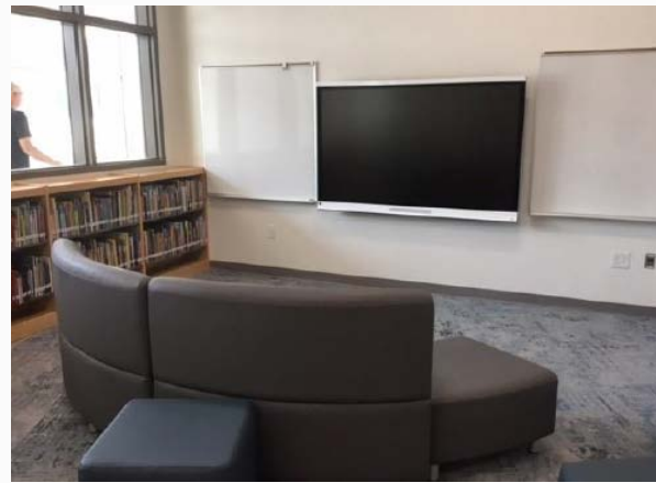
Library Collaboration Area