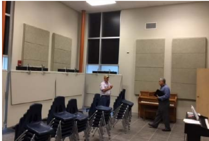
Choir Room with Acoustical Enhancements