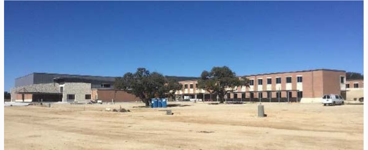
Classrooms & Bus Drop Off