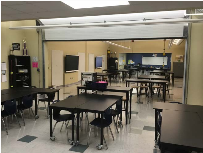
CHS – Science Addition