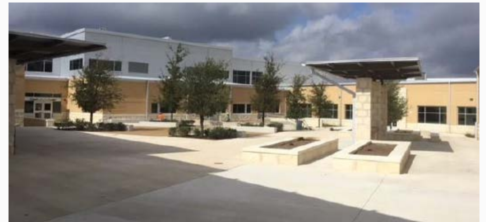
Courtyard - Outdoor Teaching Space