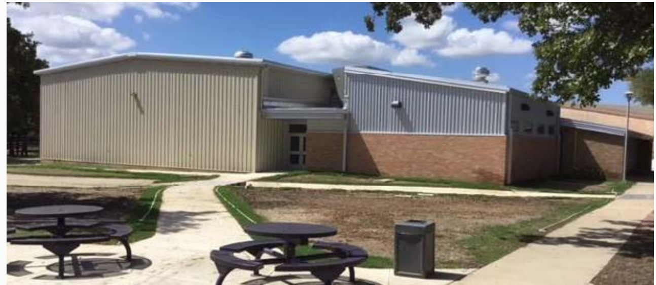
BHS - Girl's Locker Room/Shower Addition