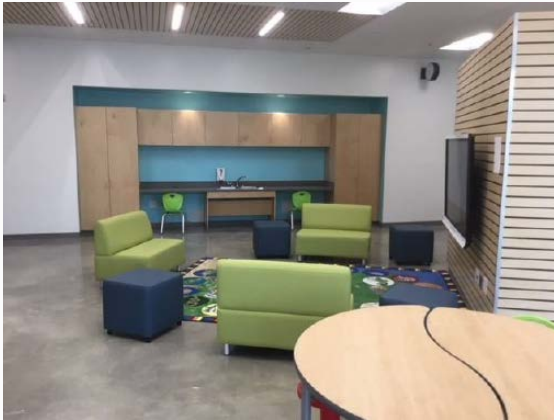
Collaborative Teaching Space