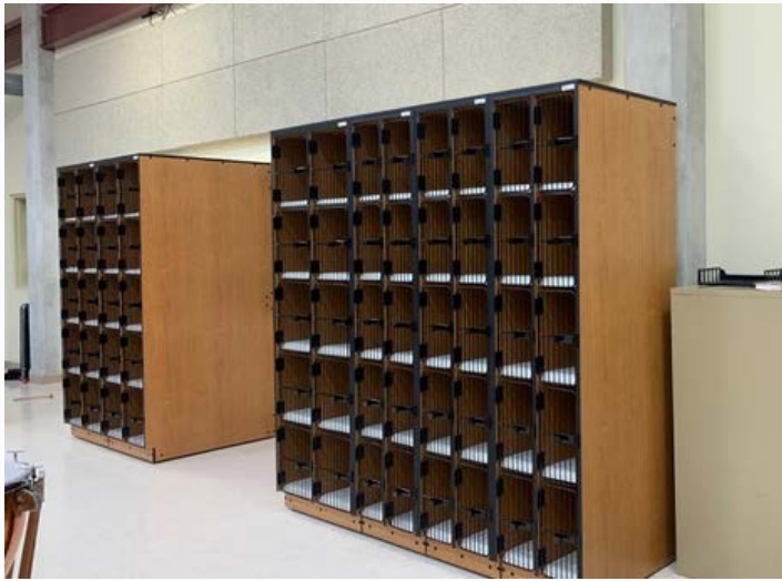
Band Instrument Storage