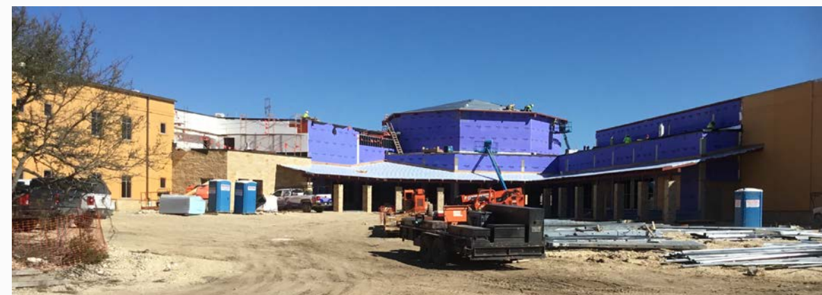
Main Courtyard View. Classrooms on left & Caf/Gym on right