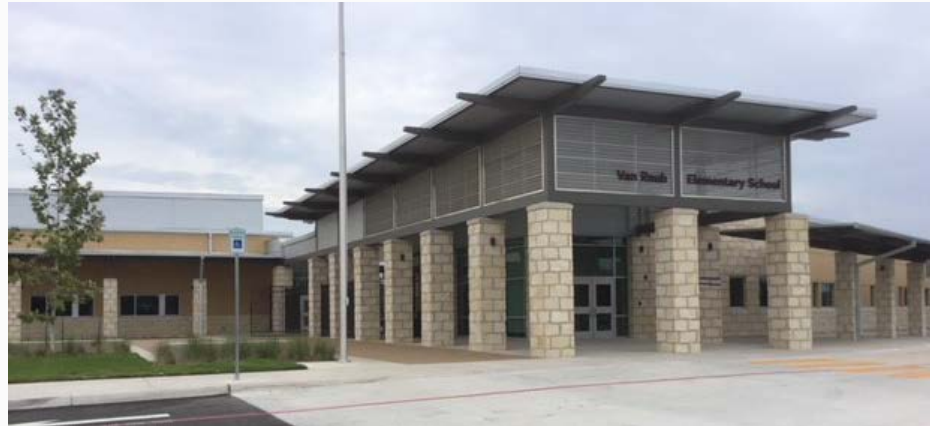
Front Entry/Parent Drop-Off