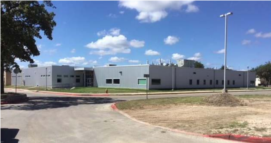
BHS Classroom Addition - 2 Science & 4 General Classrooms