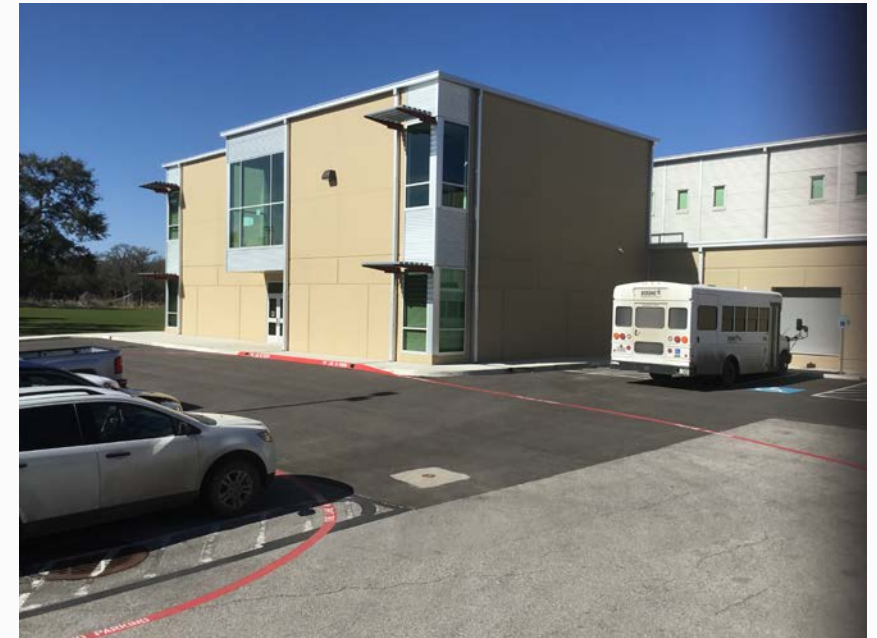
CHS – 6 Classroom Addition