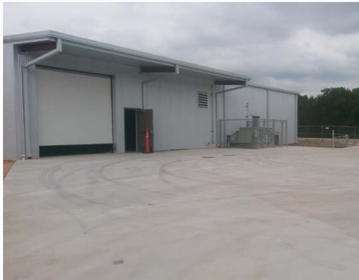
CHS Ag Classroom/Shop Addition