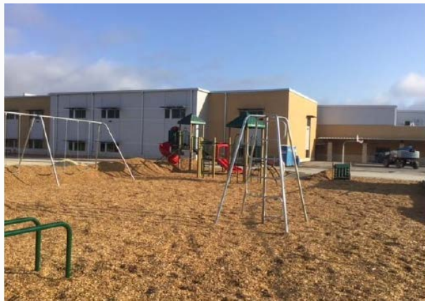
Upper Level Playground