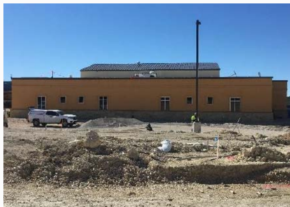
First Grade & Kinder Classrooms