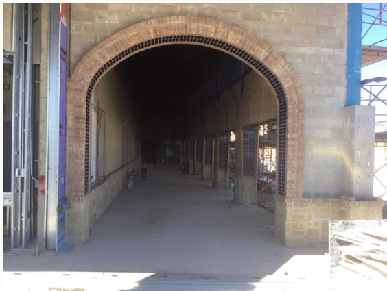
Main Entrance Arcade