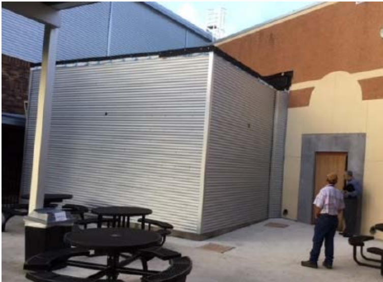
Additional Band Storage Room