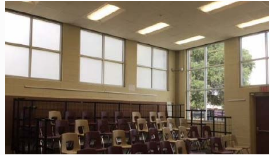
Choir: Acoustical ceiling, lighting & window glass treatment