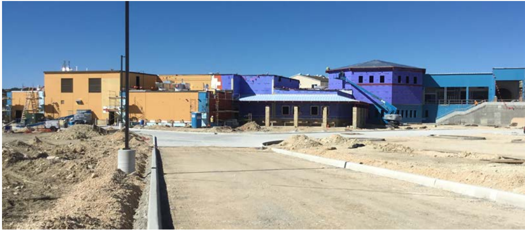
Lower Level Parking & Bus Drop Off