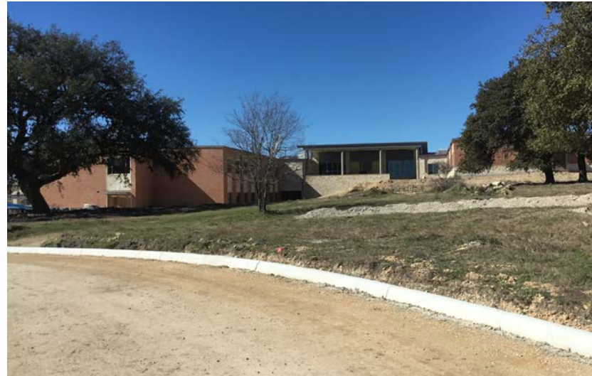
Library Courtyard & Classrooms